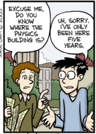
Comic courtesy of www.phdcomics.com

Please check Stanford's latest information on COVID-19 and Grad Updates often.